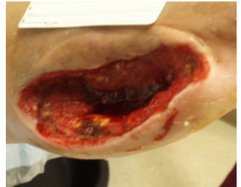
PICO sNPWT initiated