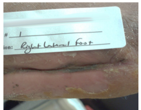
Closure achieved in part due to approximately 30 days of PICO sNPWT use (Individual results will vary)