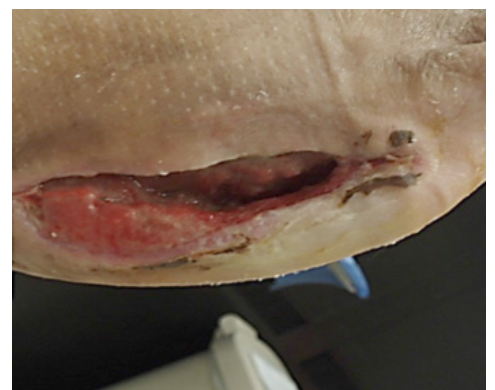
Day 7: 30% reduction in wound volume and reduction in drainage